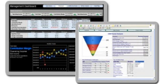
A unified global view of plans, forecast, and budgets with current and historical trends