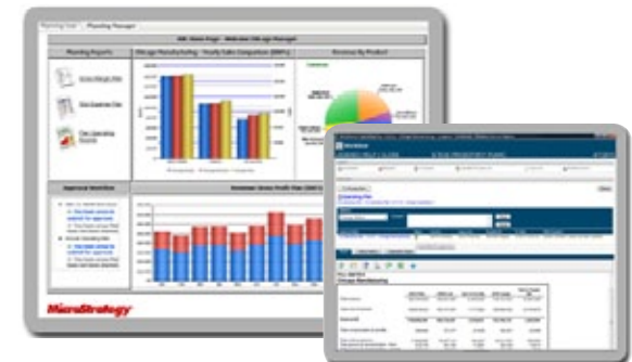
Real-time visibility into key business processes with workflow tracking, reports, and alerts ensure efficient and transparent planning process