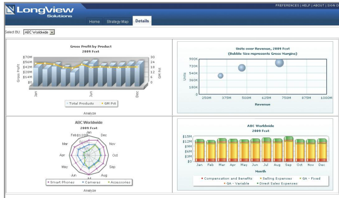
Customizable dashboards within Longview Planning give management fast, easy access to key performance indicators

To simplify and accelerate your planning, budgeting and forecasting processes, Longview Planning provides easy-to-use features, including: top-down allocation that automatically spreads high level targets across multiple dimensions such as products, customers, departments; allocating values based on seasonal and historical patterns; entering commentary at any level of detail; and calculating percentage or monetary increases/decreases.